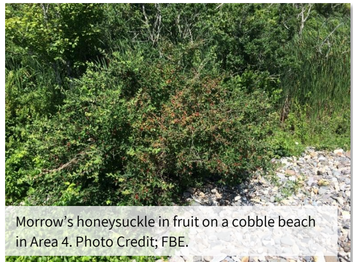
Morrow’s honeysuckle in fruit on a cobble beach in Area 4.

Given the proximity to surface waters in Area 4 the cut surface treatment using glyphosate. Mechanical devices such as Weed Wrenches could be employed to limit disturbance from larger machines, or a small skid steer could be utilized without creating significant impacts. Beach rose ( Rosa rugosa ) is currently being planted in this section as a shoreline buffer by The Federal Emergency Management Agency (FEMA), so revegetation efforts along the shoreline in Area 4 could involve planting rugosa rose in spots where honeysuckle is removed.