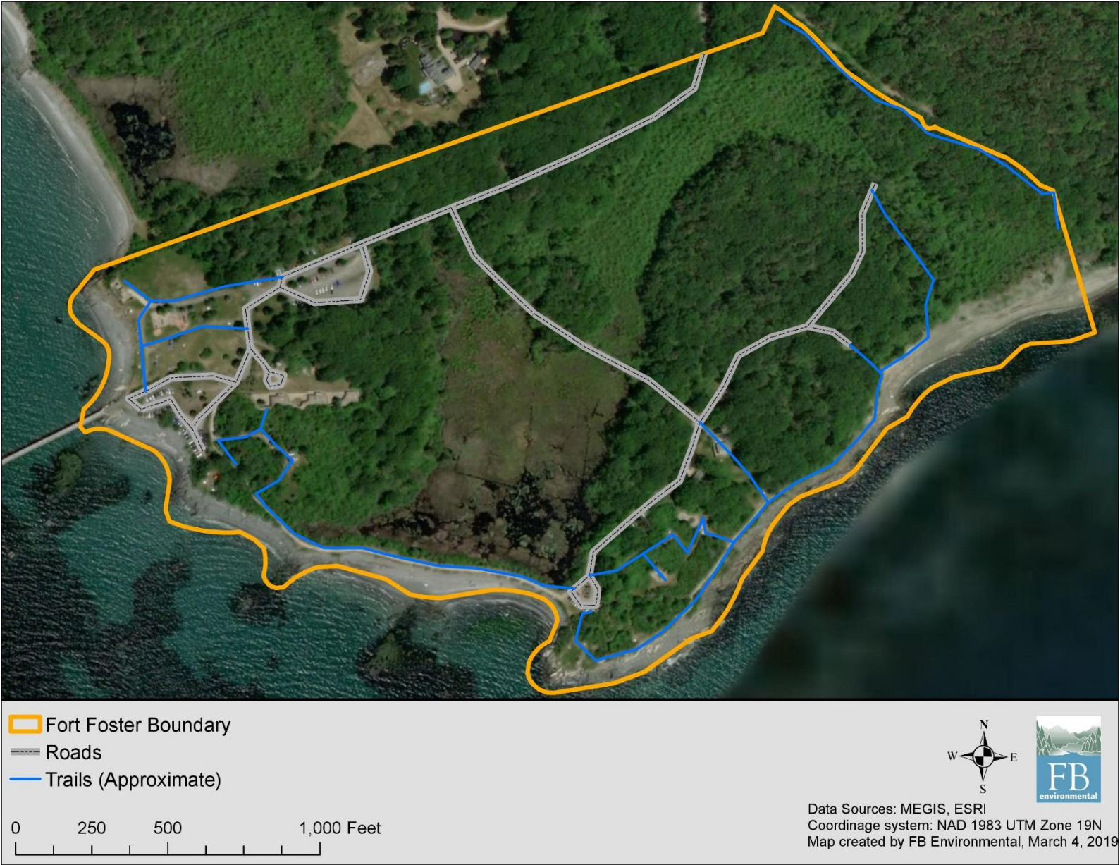
Map 1. Fort Foster Boundary Map.