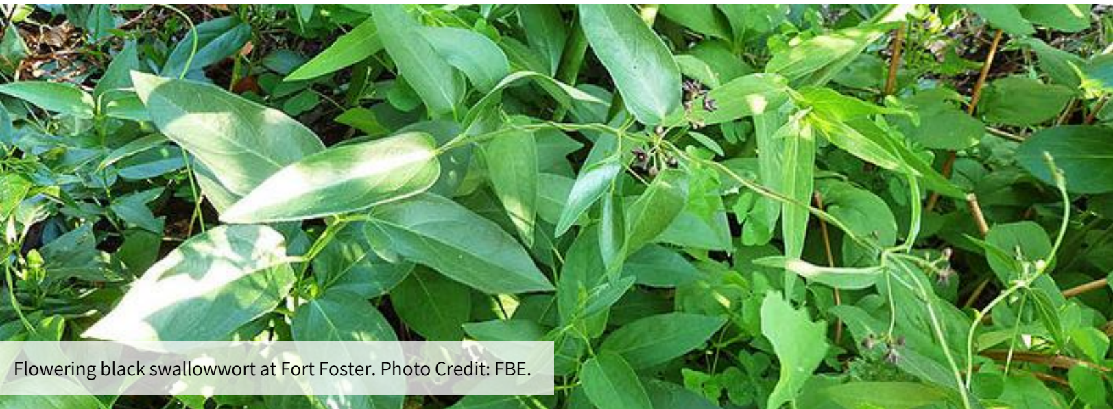
Flowering black swallowwort at Fort Foster.

Management priorities are set with the goal of achieving the greatest benefit while minimizing the total, long-term workload and project costs. It is difficult to clearly define, rank, or prioritize where invasive plant control methods should begin, as the ranking is often subjective. Rather than prioritizing areas strictly based on infestation load or probability of eradication, this management plan takes a multifaceted and staggered approach that supports sustainable, community-driven management actions. The approach is neither strictly by area or by species but by feasibility and efficiency. The following descriptions detail objectives outlined in the May 2019 stakeholder meeting.