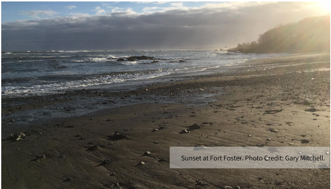
Sunset at Fort Foster.