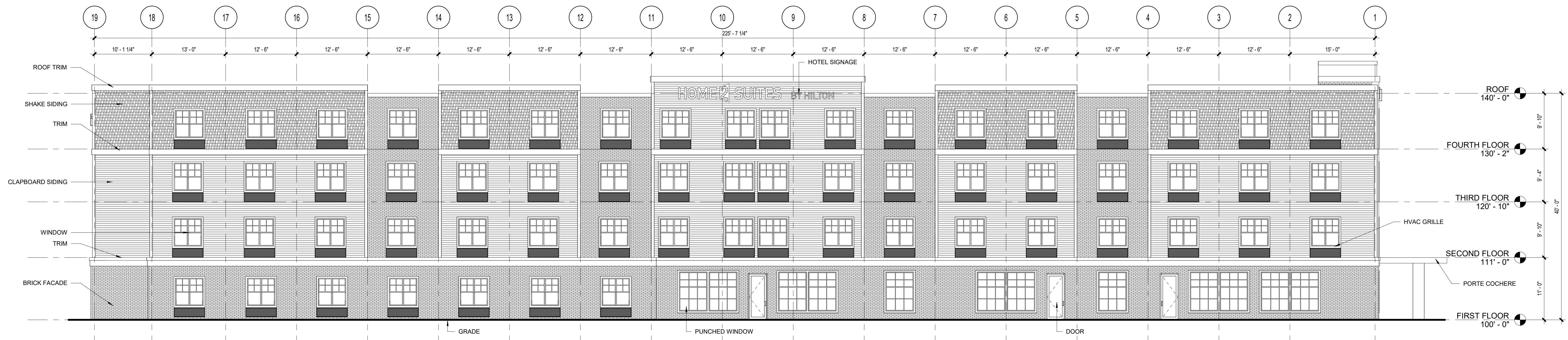
2 WEST ELEVATION 1/8" = 1'-0"