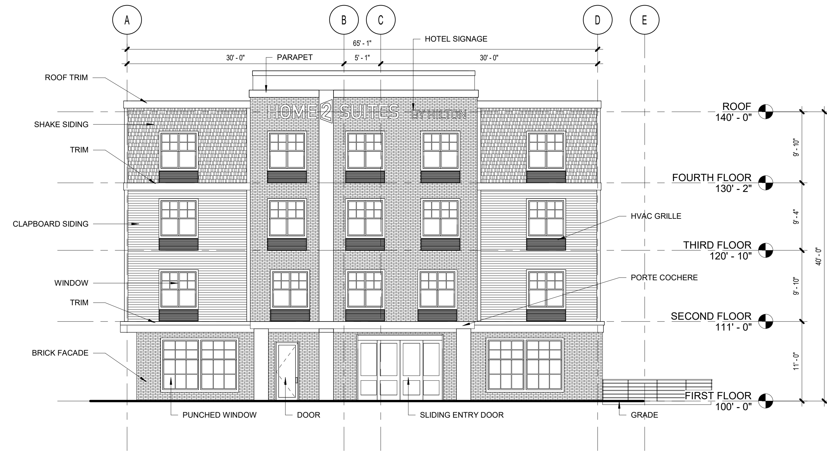
4 SOUTH ELEVATION 1/8" = 1'-0"