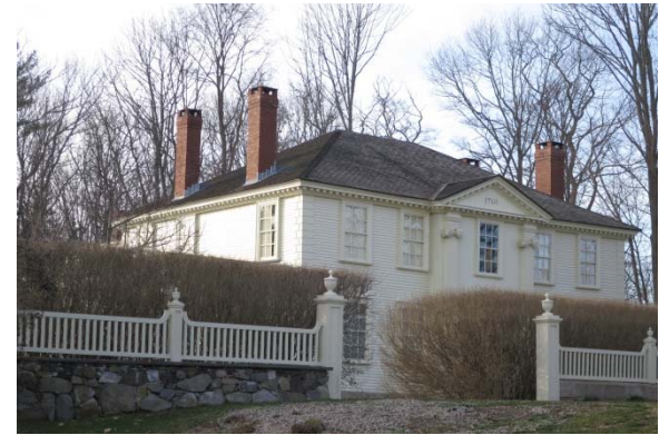
The Lady Pepperrell House, built in 1760, is a National Historic Landmark and one of the most treasured historic properties in the Town of Kittery.