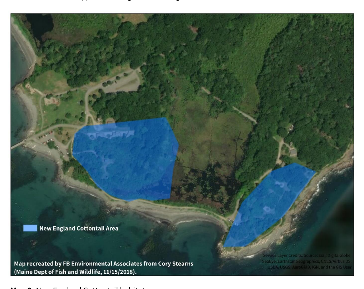
Map 2. New England Cottontail habitat map.

An assessment by Cory Sterns of Maine Department of Inland Fisheries and Wildlife (MDIFW) show that cottontail habitat in Fort Foster is predominantly clustered among the thick vegetation along The Park's southern shoreline (Map 2), which is dominated by invasives. Before any invasive management activities begin, we recommend that Mr. Stearns review and approve management strategies for cottontail habitat.