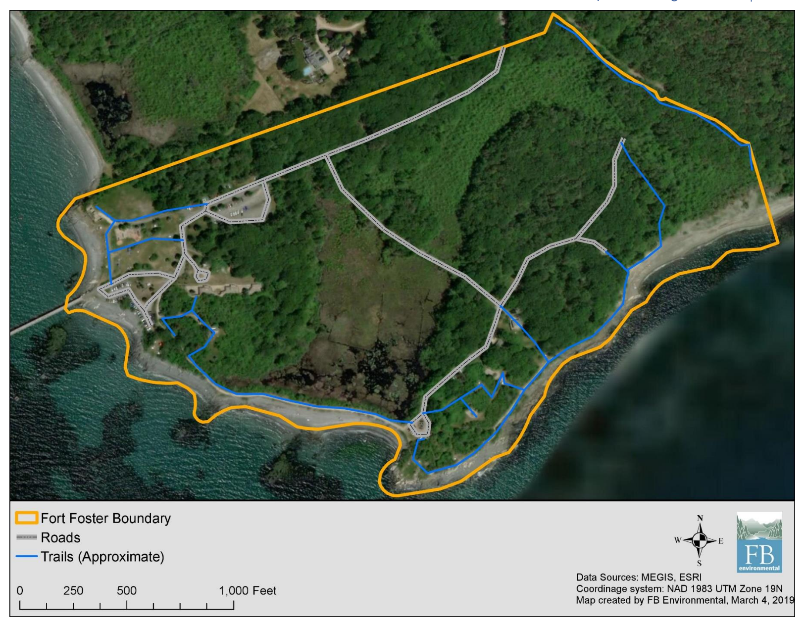
Map 1. Fort Foster Boundary Map.