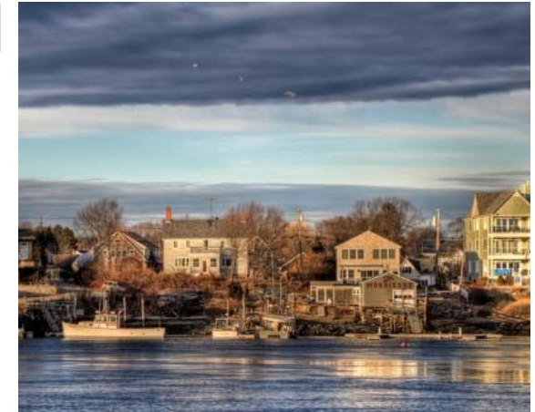
Kittery has a diversified housing stock in a desirable location

Household size is shrinking, and the number of residents over 65 is growing in Kittery.